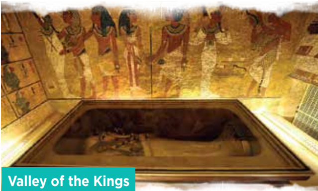
Valley of the Kings

Travel by bus to Hurghada and settle in for an overnight stay.