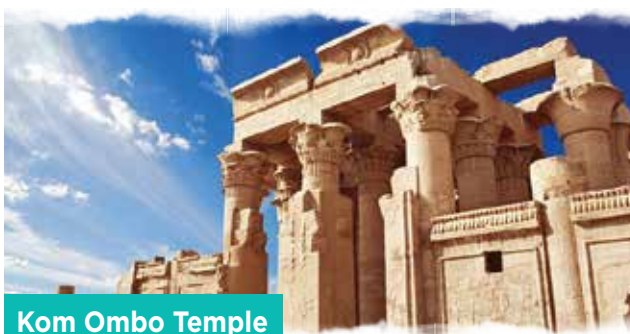
Kom Ombo Temple

Continue sailing overnight to the next historic port.