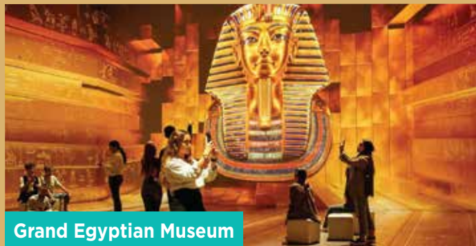
Grand Egyptian Museum