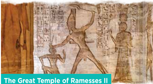
The Great Temple of Ramesses II