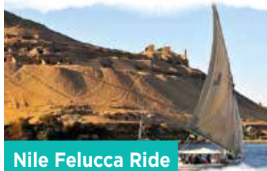
Nile Felucca Ride

Stop for photos at Aswan High Dam before continuing for dinner and overnight stay.