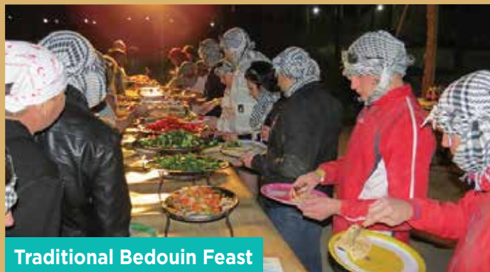
Traditional Bedouin Feast

Free and easy before heading to the airport for the flight back home.