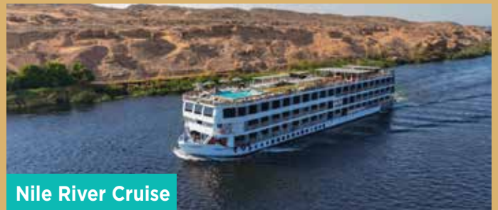
Nile River Cruise