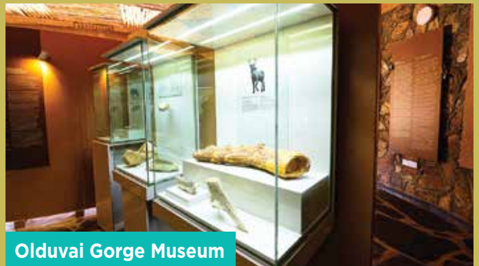
Olduvai Gorge Museum

A second day in Central Serengeti is rarely the same as the first. Today is about slowing down and staying with what the bush chooses to show. The Seronera Valley is home to some of Africa's most studied lion prides, and a second day on the ground increases the chance of finding a pride on the move, a male resting on the kopjes, or a leopard settled in the fig trees along the river.