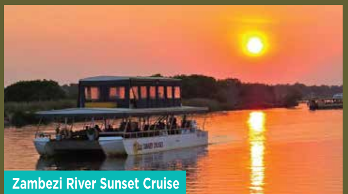
Zambezi River Sunset Cruise

Return to Cape Town for an overnight stay.