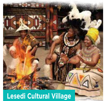
Lesedi Cultural Village

DAY 3 Pilanesberg National Park - Lanseria - Johannesburg 178KM