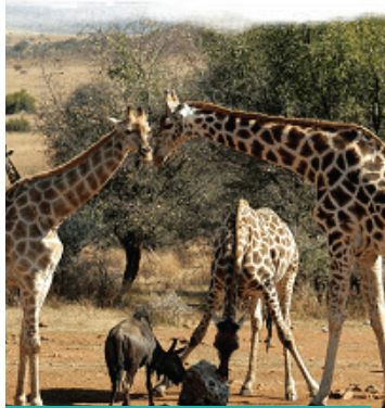
Pilanesberg National Park

Return to the hotel for dinner and an overnight stay.