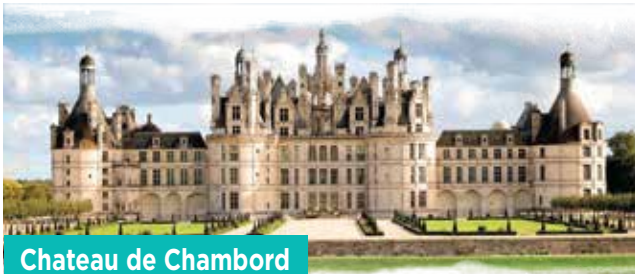
Chateau de Chambord

Rue Sainte Catherine - Enjoy personal time to shop along Europe's longest pedestrian street.