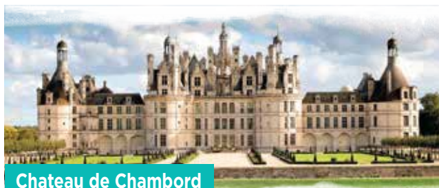
Chateau de Chambord

Rue Sainte Catherine - Enjoy personal time to shop along Europe's longest pedestrian street.