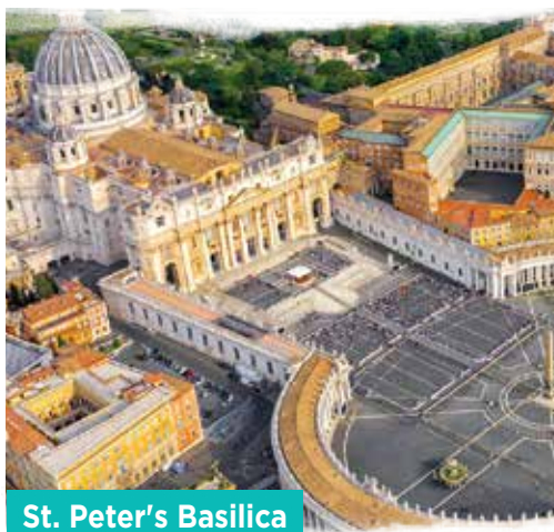
St. Peter's Basilica

Wrap up your day with a hearty Italian dinner to complete the experience.