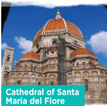
Cathedral of Santa Maria del Fiore

Proceed to Mestre (Venice mainland) for dinner and overnight stay.