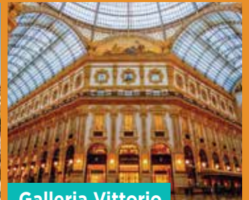
Galleria Vittorio Emanuele II