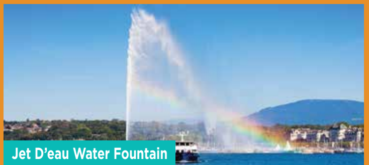
Jet D'eau Water Fountain