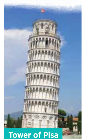
Tower of Pisa