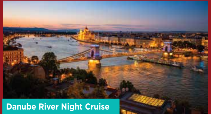
Danube River Night Cruise

Night Danube River Dinner Cruise (Included) - Witness the legends of Budapest come alive during a boat cruise paired with a memorable dinner onboard.