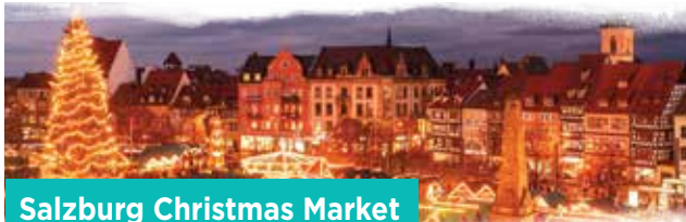
Salzburg Christmas Market

Salzburg Christmas Market - Experience Christmas unlike any other amongst huge Christmas trees set against the glistening city lights and sparkling fairy lights in this Christmas market. *Subject to opening dates.