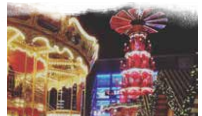
Berlin Christmas Market