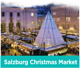
Salzburg Christmas Market

DAY 5 Salzburg - Alps Kitzsteinhorn - Salzburg 211KM