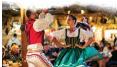
Prague Folklore Dinner