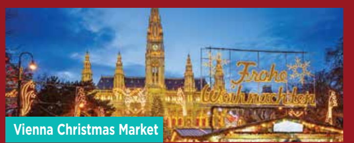
Vienna Christmas Market

Vienna Christmas Market - With over 150 booths and a magical 3,000m 2 ice-skating rink, delight in the Tree of Hearts in an amazing Christmas atmosphere! *Subject to opening dates.