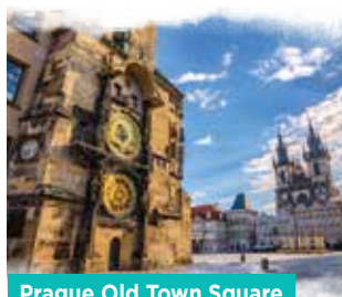
Prague Old Town Square

Spend your free time wandering about till departing to Salzburg for an overnight stay.