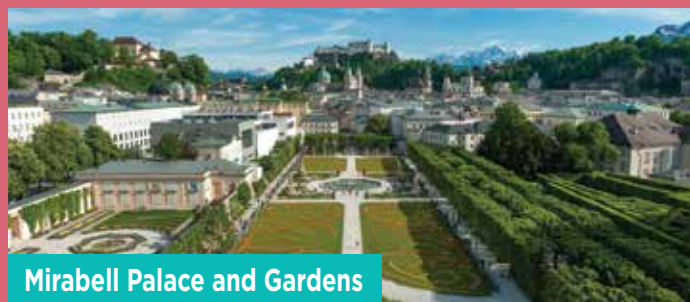
Mirabell Palace and Gardens

Continue the tour to Salzburg Cathedral , St Peter's Abbey , Mozart's Birthplace , and Residenzplatz .