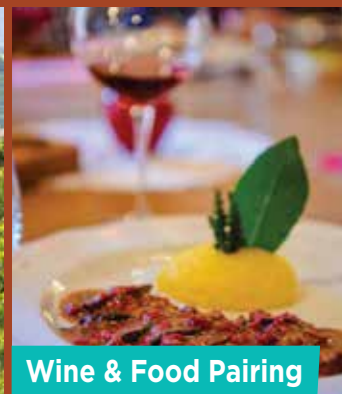
Wine &amp; Food Pairing