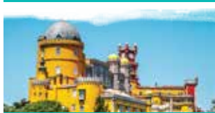
Pena National Palace