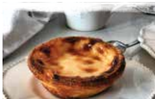
Portuguese Egg Tart