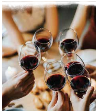
Port Wine and Gourmet Food Pairing

Famous Portuguese Egg Tart - Indulge in the "World's Best" Portuguese tart from Pastéis de Belem, a Lisbon must-try, then take personal time to explore Rossio Square and Rua Augusta .