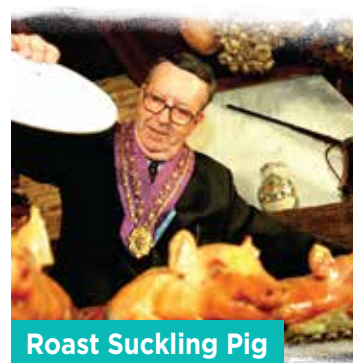
Roast Suckling Pig