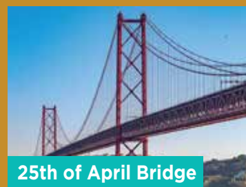
25th of April Bridge