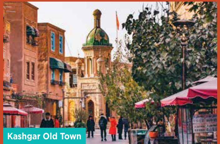
Kashgar Old Town

Kashgar Old Town 喀什古城 (西城) - Enjoy free time exploring the lively streets and local culture of Kashgar Old Town's West City. Travellers are encouraged to visit the century-old teahouse* , experiencing the relaxed rhythm of Uyghur daily life before the farewell dinner on the final night. *Suggested activity is not included in the tour price.