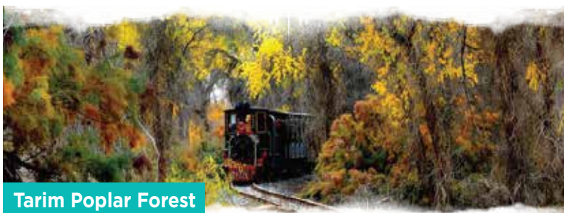
Tarim Poplar Forest

Upon arrival in Korla 库尔勒, a vibrant oasis city along the ancient Silk Road and the gateway to your Southern Xinjiang journey, enjoy a dinner before checking in to the hotel.