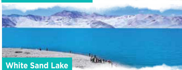
White Sand Lake