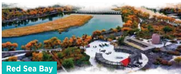
Red Sea Bay

Continue to Aksu for a hearty dinner and overnight stay.