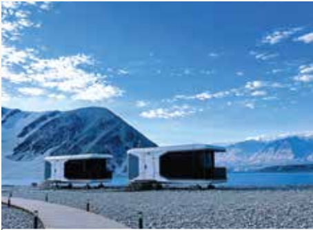
Yijing Baisha Camping Hotel (Baisha Lake) 逸镜白沙营地 (白沙湖店)