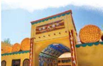
Grand Naan City

Continue to Luntai 轮台 for dinner and overnight stay.