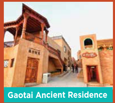
Gaotai Ancient Residence