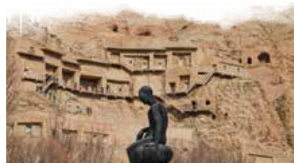
Kizil Thousand Buddha Caves

DAY 3 Luntai - Kuqa - Kizil Caves - Kuqa