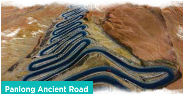
Panlong Ancient Road

Check in to a unique scenic stay near White Sand Lake and enjoy a peaceful evening beneath the starry skies of Western China. *Facilities may differ from city hotels due to the remote highland location.