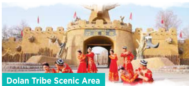
Dolan Tribe Scenic Area

As evening falls, enjoy a traditional Uyghur dinner featuring aromatic Hand Grab Rice 手抓饭 and freshly grilled Lamb Skewers 羊肉串 before settling in for the night.