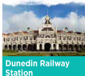
Dunedin Railway Station

DAY 5 Christchurch - Oamaru - Dunedin 360KM