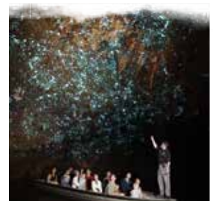
Waitomo Glowworm Caves