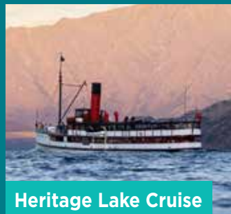
Heritage Lake Cruise

Continue to Queenstown for dinner and an overnight stay.