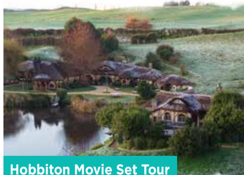
Hobbiton Movie Set Tour

Return to Rotorua for dinner and overnight stay.