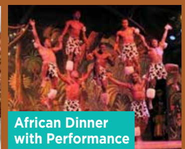
African Dinner with Performance