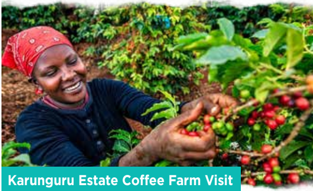
Karunguru Estate Coffee Farm Visit

The adventure comes to an end. Till next time!