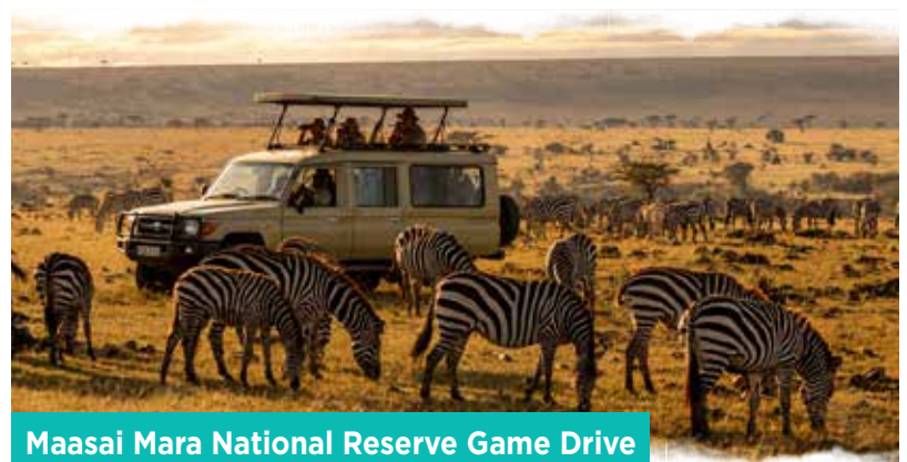
Maasai Mara National Reserve Game Drive

Return to camp for dinner and an overnight stay.