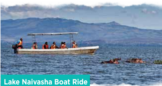
Lake Naivasha Boat Ride

Head out for your final Afternoon Game Drive across the Maasai Mara. The migration moves daily and no two drives are ever the same. A fitting close to three days in one of Africa's greatest wilderness areas, before returning to camp for dinner and an overnight stay.