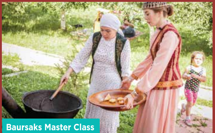
Boursaks Master Class

Return to Almaty for leisure time before transferring to the airport for your flight home.