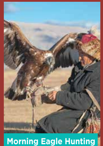
Morning Eagle Hunting