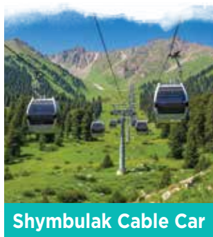
Shymbulak Cable Car