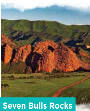
Seven Bulls Rocks