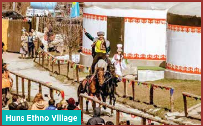
Huns Ethno Village