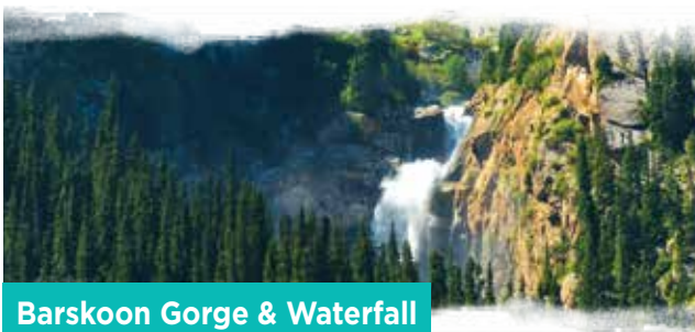
Barskoon Gorge & Waterfall

Cross the border into Karakol , Kyrgyzstan, and proceed to dinner and an overnight stay.