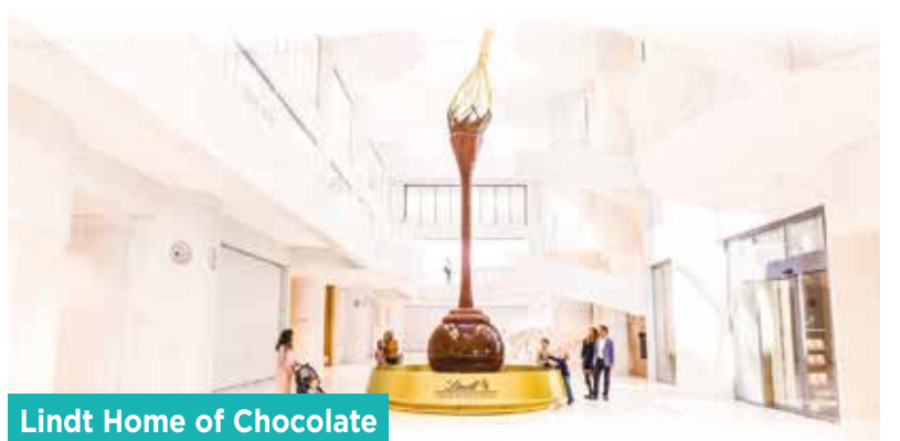
Lindt Home of Chocolate

Zurich Christmas Market - Explore Zurich's Christmas Market with family-friendly activities, from ice skating, carousel rides, to festive shoppings. Savour local delicacies, immerse in the festive atmosphere, and create lasting memories with your loved ones.