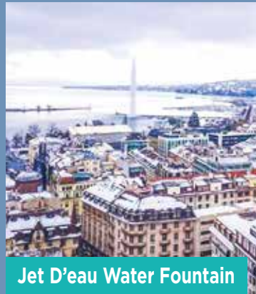
Jet D'eau Water Fountain