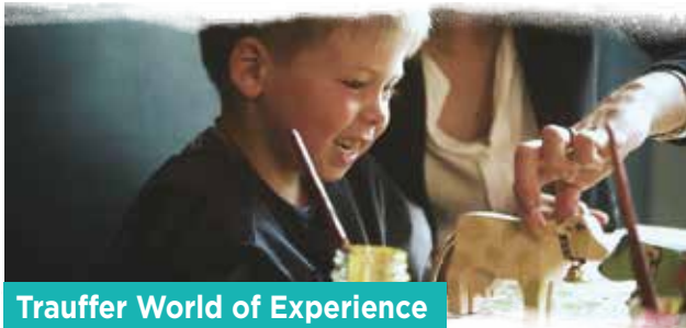
Trauffer World of Experience

End the day in Interlaken with a relaxing dinner featuring Raclette , perfect for unwinding after a day of exploration.